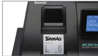
2 Station Printer