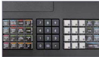
48 Raised Keys