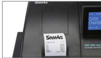
1 Station Printer