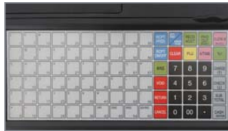
90 Flat Keys