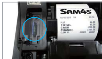
SD Card Slot